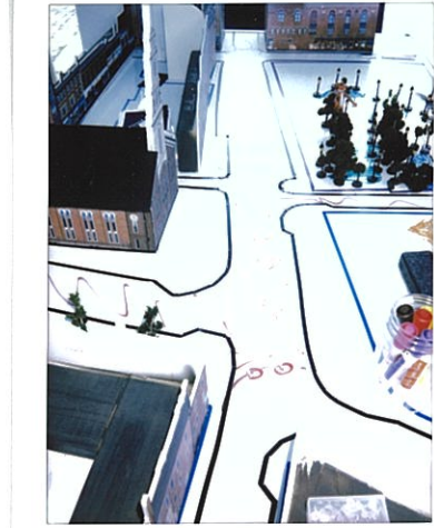
"CLOSE PLEASANT AND CONGRESS TO BE PEDESTRIAN ONLY"