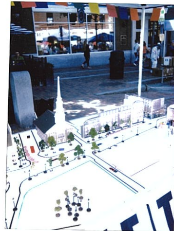
"EXTENDED SIDEWALKS ON PLEASANT AND CONGRESS"