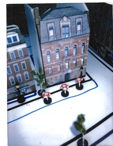
"OUTDOOR DINING @ CONGRESS AND FLEET"