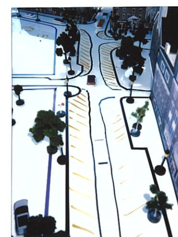
"CONGRESS SHOULD BE SINGLE LANE AND WIDEN SIDEWALKS"