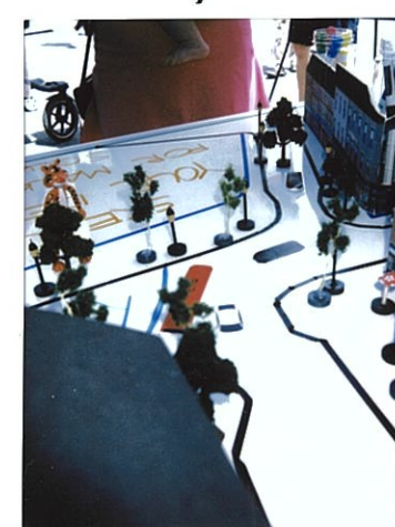
"CLOSE CONGRESS AT DANIEL AND HAVE TRAFFIC GO FROM MARKET TO PLEASANT"