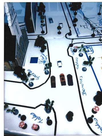
"BENCHES! TABLES! GAZEBO!"