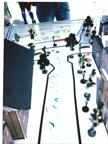
"WALKING FOR ALL OF PLEASANT STREET"