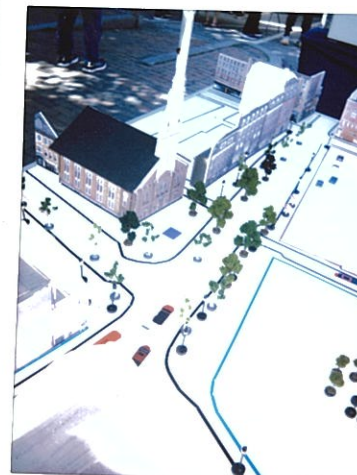
"PEOPLE ONLY! BRING TREES INTO STREET"