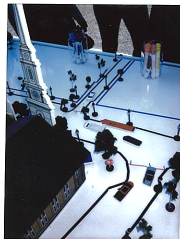
"CONGRESS STREET CLOSED TO VEHICLES"